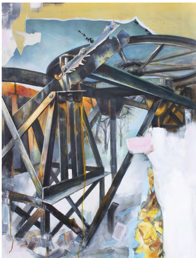
Old Winding Gear 2016 Oil on linen 126 x 96 cm