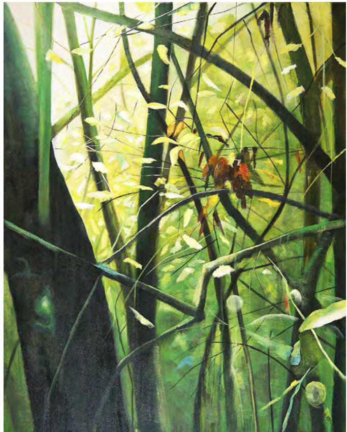
Below right Water Wheel 2014 Oil on board 150 x 100 cm