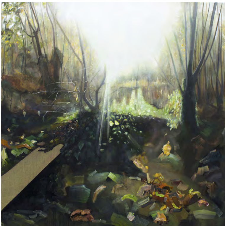
Leaves On The Sublime 2015 Oil on linen 100 x 100 cm